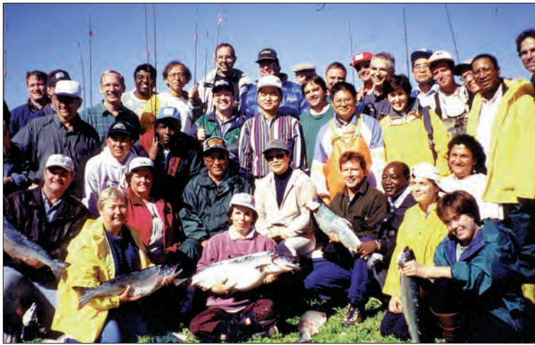
(Photos) Above: True Parents with a group of mostly Western participants of the 7.8 Jeol celebration fishing expedition; Below: a group comprising mostly Korean leaders.

to create the Kingdom of Heaven in heaven and on earth, You had to pass through a history of hardships, suffering and blood, and You know that the True Parents feel ashamed about this. Heavenly Father! You are the king of kings presiding over heaven and earth. You are the very center of love, the parent of all humankind, the teacher, and the owner of the kingship of love. As You have been following Your lost child, You had to go through such a suffering course without being able to make it known. But You willingly persevered and in order to go beyond this You established on this earth the 7.8 Jeol. For this we sincerely thank You.