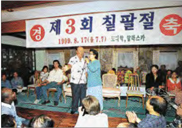
Father and Mother sing at the evening entertainment

in front of us around the time of my becoming eighty years of age.