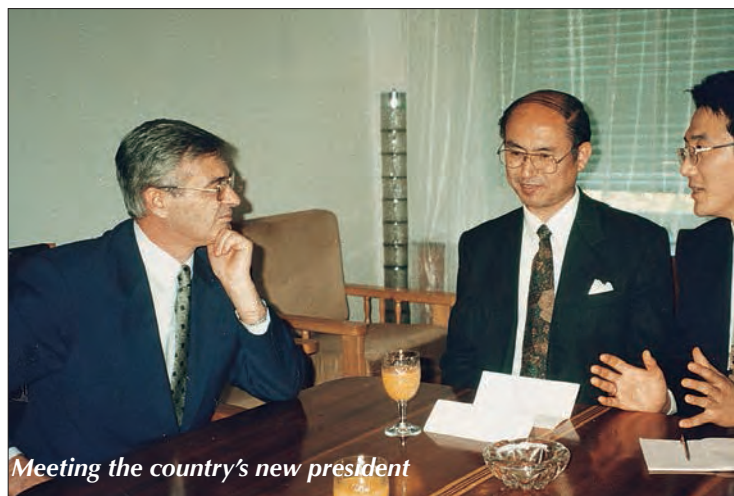
Meeting the country's new president