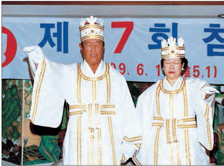
True Parents give the benediction for the 37th True Day of All Things and the Declaration of True Parents' Cosmic Victory

You must, in turn, receive that inheritance from the Parents. You must understand what kind of path that involves. You must dedicate yourselves to liberating God, True Parents, and all things.