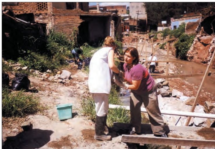
RYS participants carry out the arduous but rewarding task of ridding a local neighborhood of uncollected garbage

That is why, even with almost no central funding, we will have maybe eight projects this year. Because it's their vision now, and they've experienced it firsthand and want to recreate that experiment in their own communities.