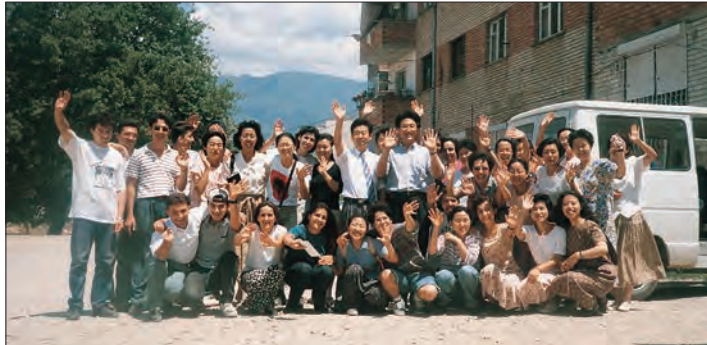
Albanian members during the blessing campaign of 1997