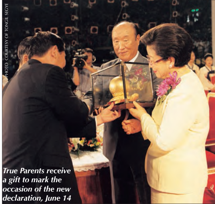
True Parents receive a gift to mark the occasion of the new declaration, June 14